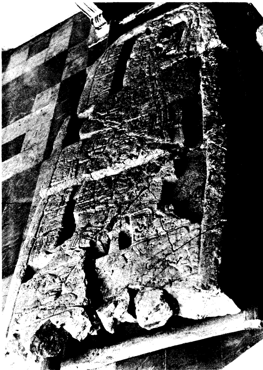
STELA 24 AT THE GUATEMALA NATIONAL MUSEUM OF ANTHROPOLOGY AND HISTORY BEING READIED FOR SHIPMENT TO MIAMI