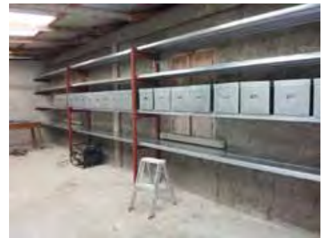
New termite-proof steel and aluminum shelves and zinc artifact storage boxes were installed in one room of the Lamanai site bodega in June 2014. They need about 500.