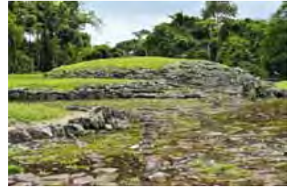
A trip to Guayabo National Monument is a trip back in time. At El Guayabo, walk through thousand-year old streets; observe ancient stone-and-wood homes; examine petroglyphs and stone statues; and explore aqueducts that once carried water from nearby streams to on-site storage pools.

Costa Rica is not only a land between two oceans, it is also a land between two continents. While it received its metal technology from the south, much of its ceramic motifs as well as jade arrived from the north via migrants from various parts of Mesoamerica. The presentation will also include a visit to the Precolumbian site of El Guayabo de Turrialba. The city, known as a chiefdom, was a key political, economic, and religious center.