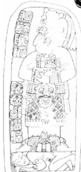
Drawing of Naranjo Stela 24 by Ian Graham for the Corpus of Maya Hieroglyphic Inscriptions Program of the Peabody Museum.

All meetings begin at 8 pm • Institute of Maya Studies • Miami Science Museum