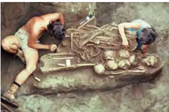
Excavation of a multiple burial (dated to around 1200 CE) at the Nacascolo site, on the north side of Culebra Bay.

two promontories that were part of a public assembly area. This path, known as Caragra, served one of the main gates of the ancient settlement. SINAC is committed to continue restoration efforts in Guayabo, which will include modern drainage systems to protect the structures and an overhaul of the existing visitor paths so that all structures can be fully appreciated. 🏛️