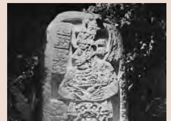
Stela 24 from Naranjo