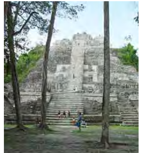
The Lamanai High Temple. Residents from the local village of Indian Church can be seen on the structure from when they took a Cultural Heritage class conducted by Lamanai archaeologists and learned about the ancient Maya site they live near.