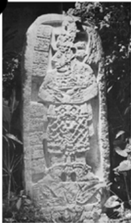
Stela 24 at the dedication ceremony held in Gallery A on January 30, 1974. Cover image from Museum of Science Annual Report 1973-1974.