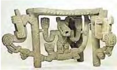
This ceremonial metate – basically a fancy, special-occasion version of the grinding stones used for everyday cooking – is carved from a single piece of stone.

Costa Rica is not only a land between two oceans, it is also a land between two continents. While it received its metal technology from the south, much of its ceramic motifs as well as jade arrived from the north via migrants from various parts of Mesoamerica. The presentation will also include a visit to the Precolumbian site of El Guayabo de Turrialba. The city, known as a chiefdom, was a key political, economic, and religious center.