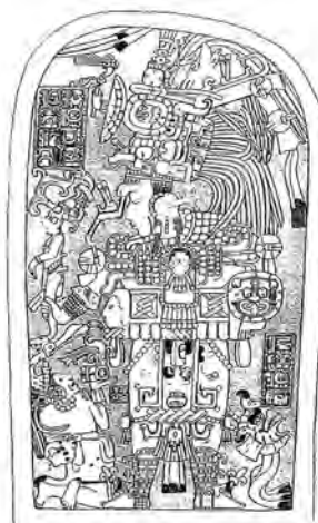
L) Machaquila Stela 2 on display in National Museum of Archaeology and Ethnology in Guatemala City. R) Drawing of Machaquila Stela 2 by Ian Graham for the Corpus of Maya Hieroglyphic Inscriptions Program of the Peabody Museum.

the sponsorship was held in Gallery A of the Museum on March 23, 1972.