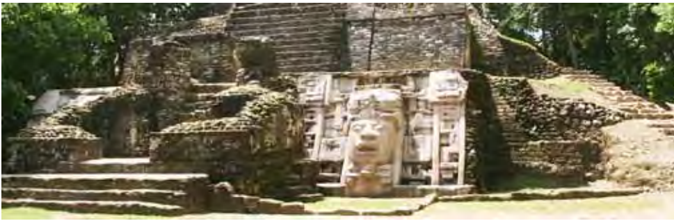
Lamanai's Temple of the Masks, Structure N9-56, is the featured photo in the website's masthead.